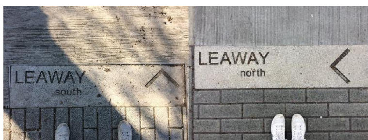
Leaway markers between Stratford High St and Cody Dock